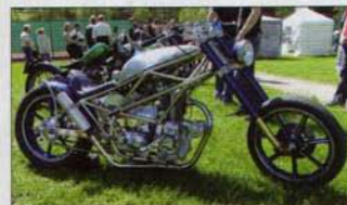
A Weslake engined special was one of the more exotic entries