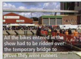
All the bikes entered in the show had to be ridden over the temporary bridge to prove they were runners