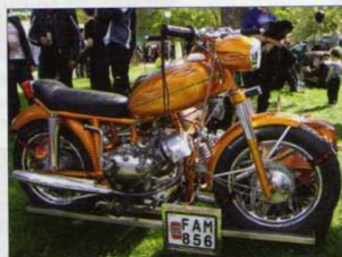
This monkey bike matched the trike is was transported on