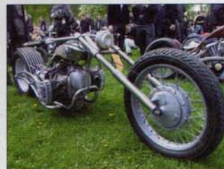
This radical BMW shows the innovative design typical of Scandinavian builders